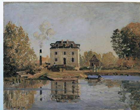
Alfred SISLEY Fabrique pendant l'inondation 1873