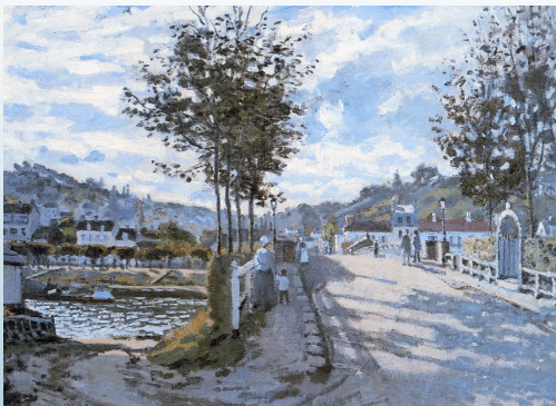
Claude MONET Le pont de Bougival 1869-1870