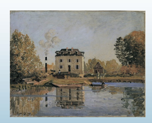
Alfred SISLEY Fabrique pendant l'inondation 1873